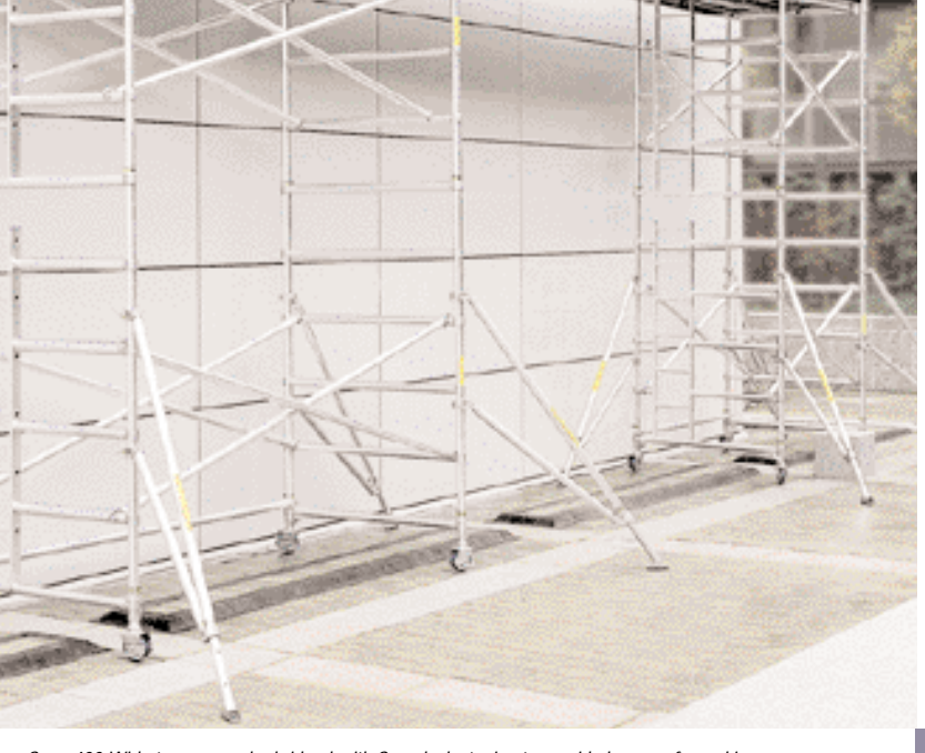
Span 400 Wide towers can be bridged with Spandeck staging to provide large, safe working areas.